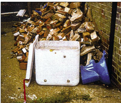
An AC water tank